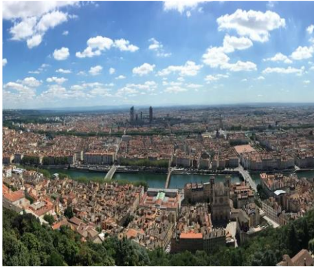
Métropole de Lyon