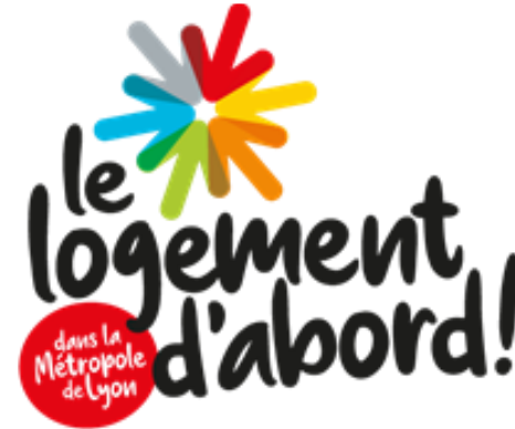
Métropole de Lyon